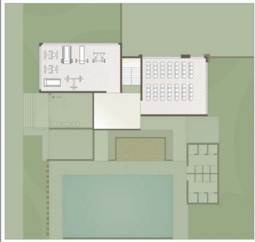
CLUB FIRST FLOOR PLAN

CLUB House Area : 3830 sq.ft Garden Area : 13780 sq.ft